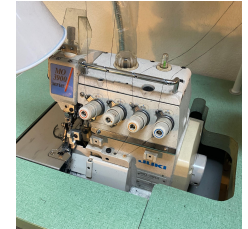
Industrial (Overlocking) Machine

It's the seam you will see on the inside of clothing