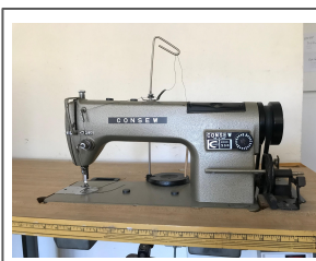
Industrial machine : for strong sewing and high volume sewing Heavy duty Can do thick sewing like leather and vinyl! Used for high output sewing - like sewing done in clothes factories