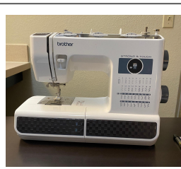
Home sewing Machines For all light duty sewing Used for clothes and fabrics